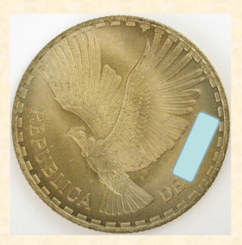
Condor in flight