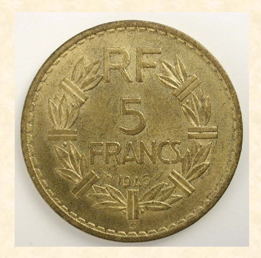
1945 5 Francs