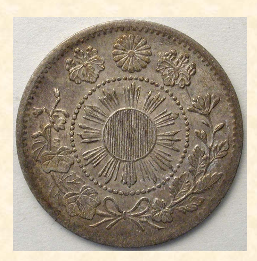
1871 5 Sen (Meiji Empire)