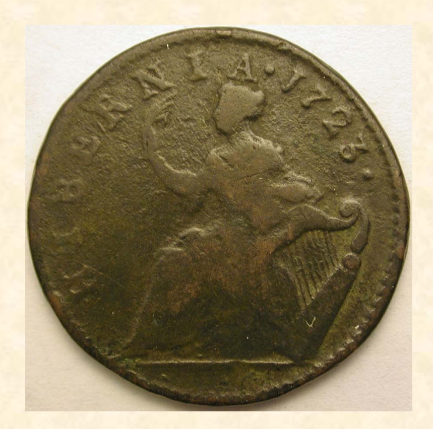
1723 Hibernia Halfpenny