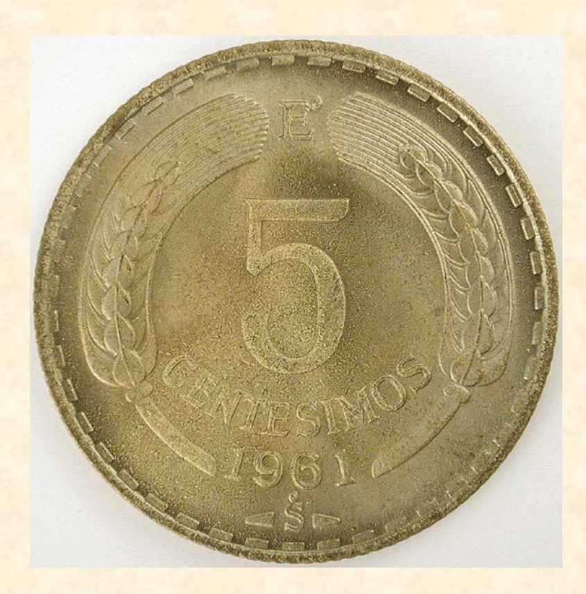
1961 5 Centesimos (S Mint = Santiago)